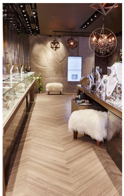
(N) Caroline Néron - Creator and actress PDB Concrete Skin - raw finish, embossed logo 24" x 48" - Nickel