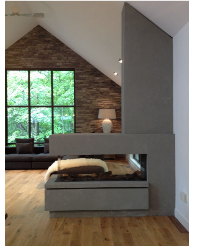
Waxed Concrete - Ash