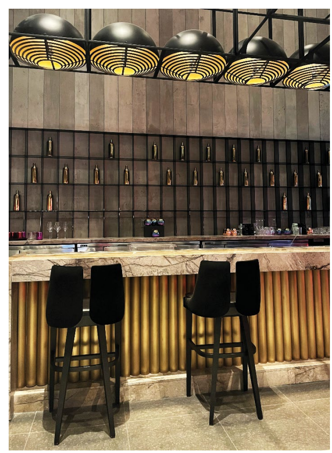
W Marriott W Hotel - PDB Concrete Skin - raw finish 8" x 48" - Oxygen