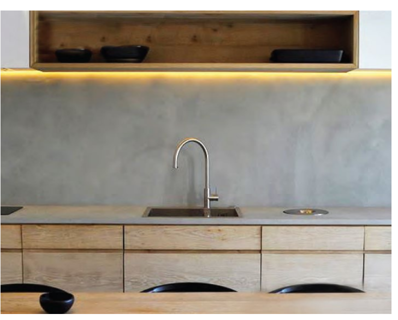
Waxed Concrete - Mineral