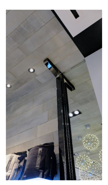
Browns Store-PDB Concrete Skin - raw finish 8" x 48" - Nickel