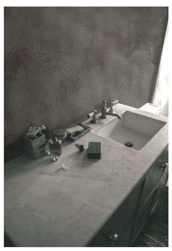
Waxed Concrete - Ash