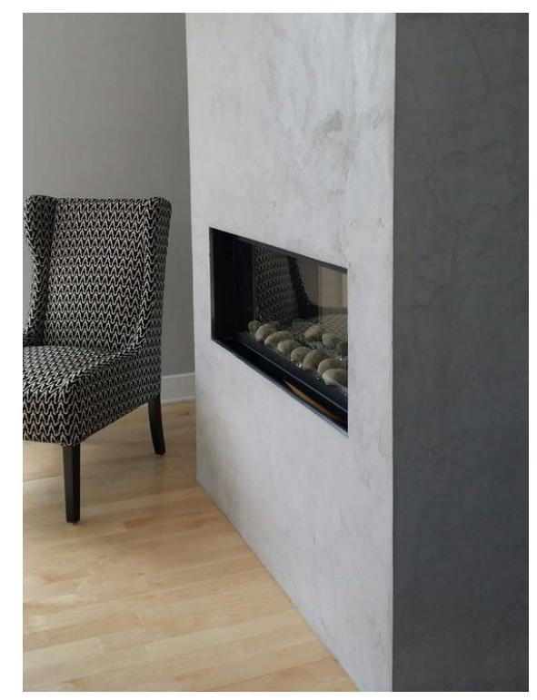
Waxed Concrete - Mineral