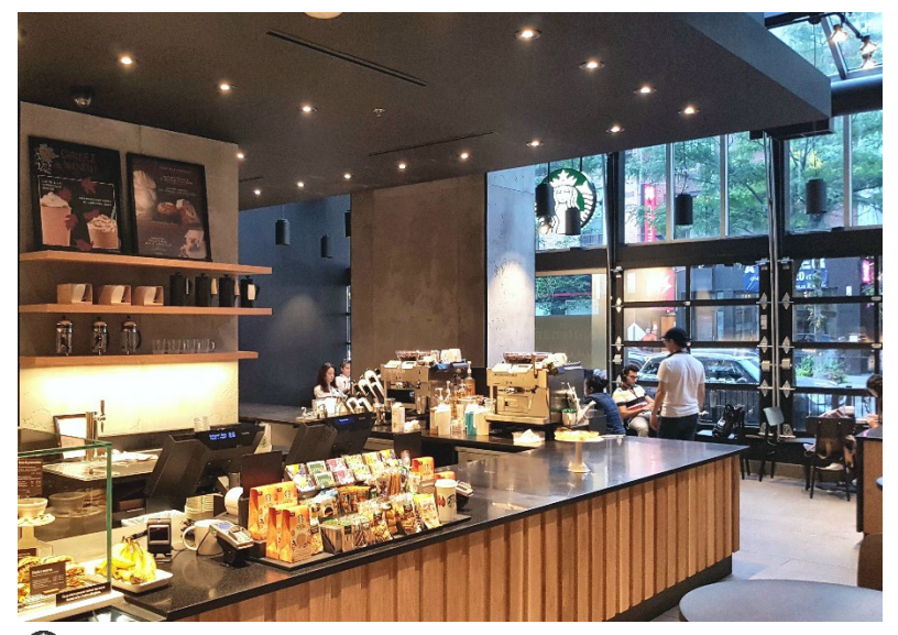
Starbucks - PDB Concrete Skin - raw finish 48" x 96" - Oxygen