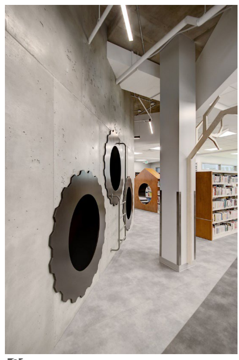
Brossard Public Library - PDB Concrete Skin - raw finish - Oxygen - Custom-made