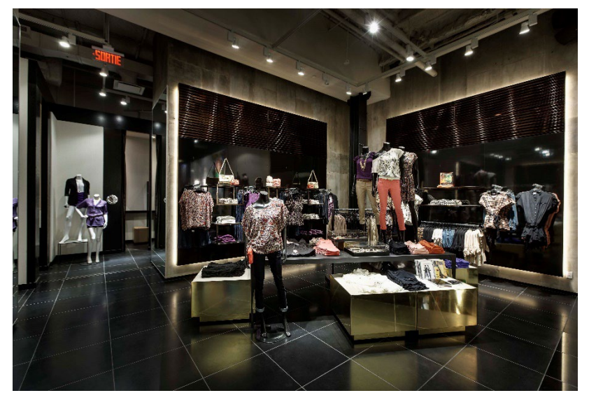
Dynamite Boutique - PDB Concrete Skin - raw finish 16" x 48" - Oxygen