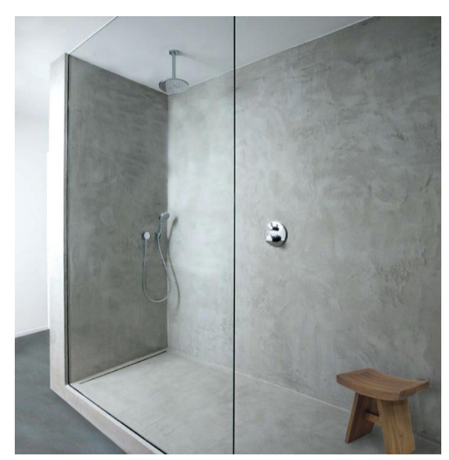
Waxed Concrete - Mineral