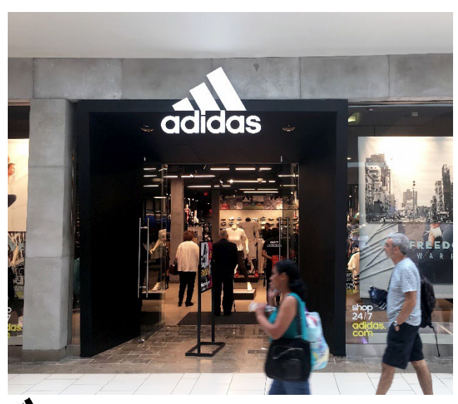
adidas Boutique - PDB Concrete Skin - raw finish 24" x 48" - Ozone