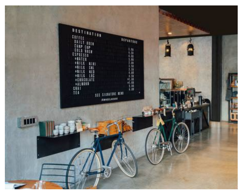
Waxed Concrete - Natural