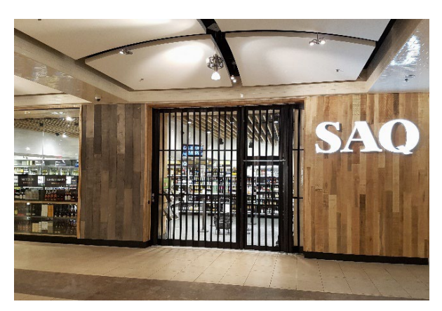
SAQ Store - PDB Concrete Skin - raw finish - Custom size & color