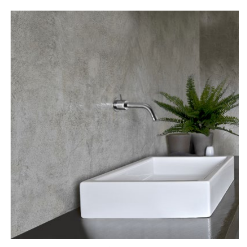
Waxed Concrete - Limestone